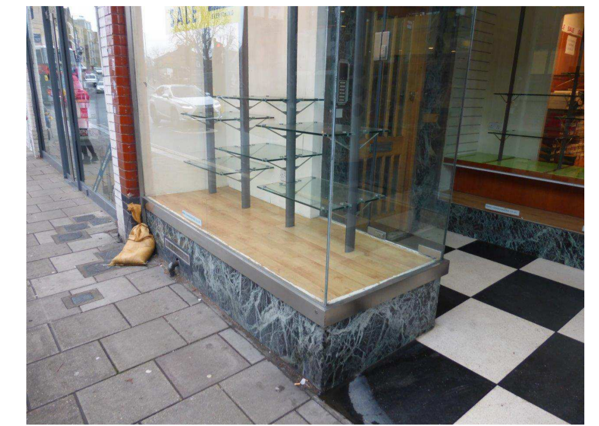
PHOTOGRAPHS OF EXISTING